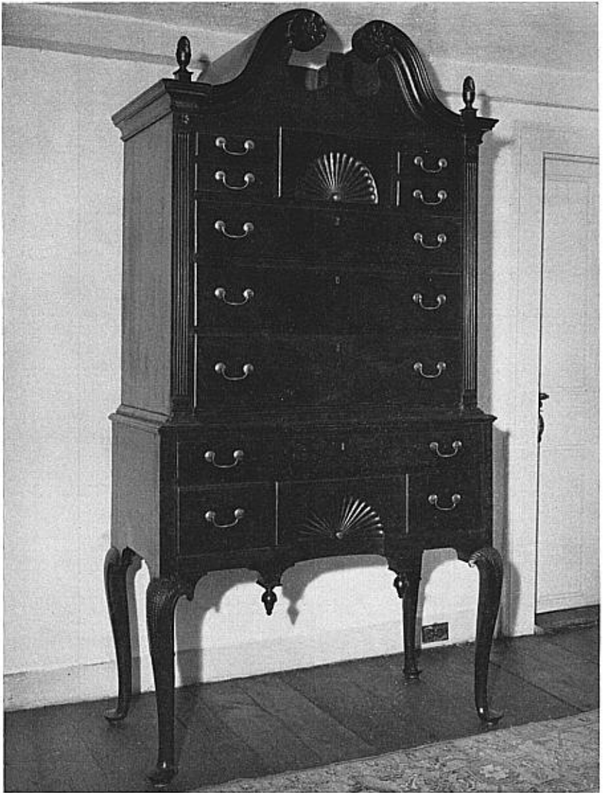
MAHOGANY, CHIPPENDALE-TYPE HIGH CHEST ATTRIBUTED TO ELIJAH BOOTH, SOUTHBURY, CONNECTICUT Owned by the Society and exhibited in the Pratt House, Essex.