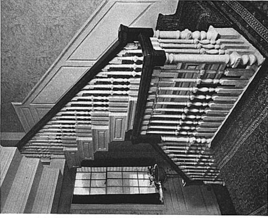
STAIRCASE, SECOND FLOOR

THE ROBERT HOOPER HOUSE (REV. ROBERT PARKER MEMORIAL) (c. 1770), MARBLEHEAD, MASS.