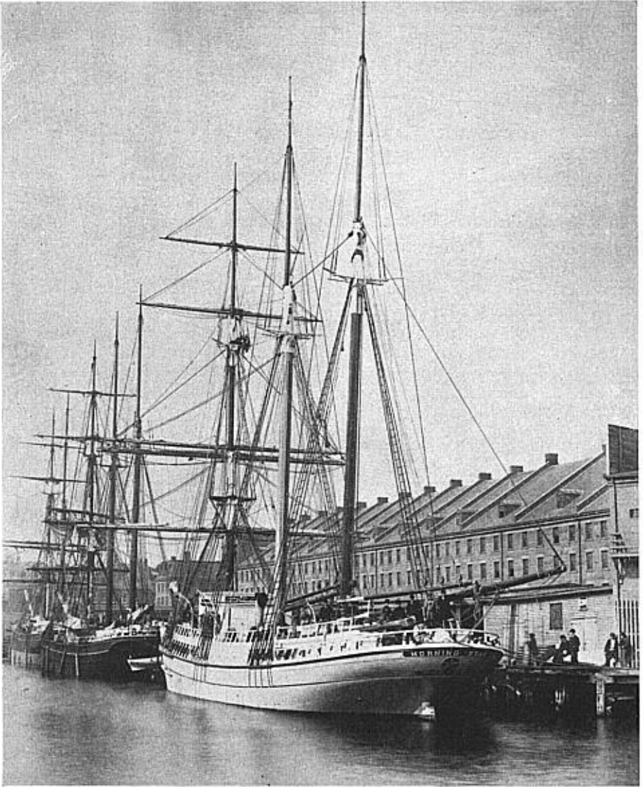
"MORNING STAR," MISSIONARY VESSEL (1884)

The fourth of the name owned (1884-1899) by The American Board of Commissioners for Foreign Missions. Built in Bath, Maine, by The New England Shipbuilding Company