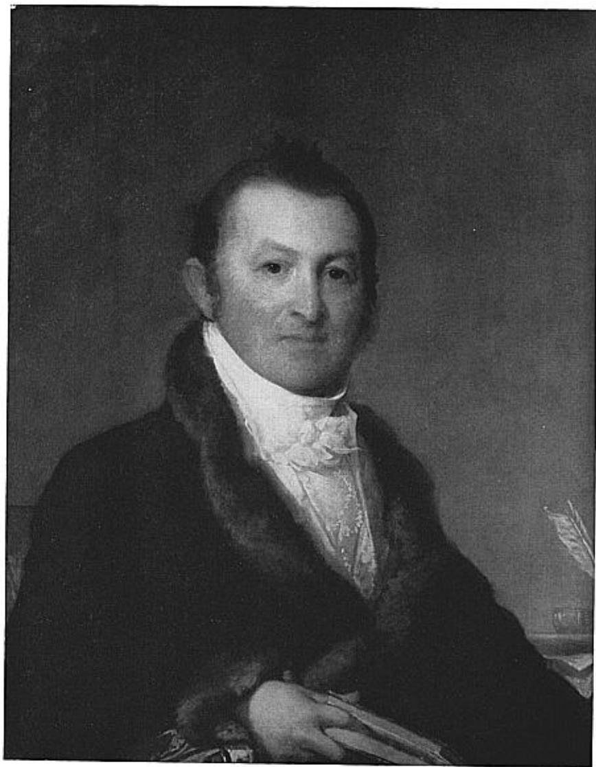
HARRISON GRAY OTIS, BY GILBERT STUART