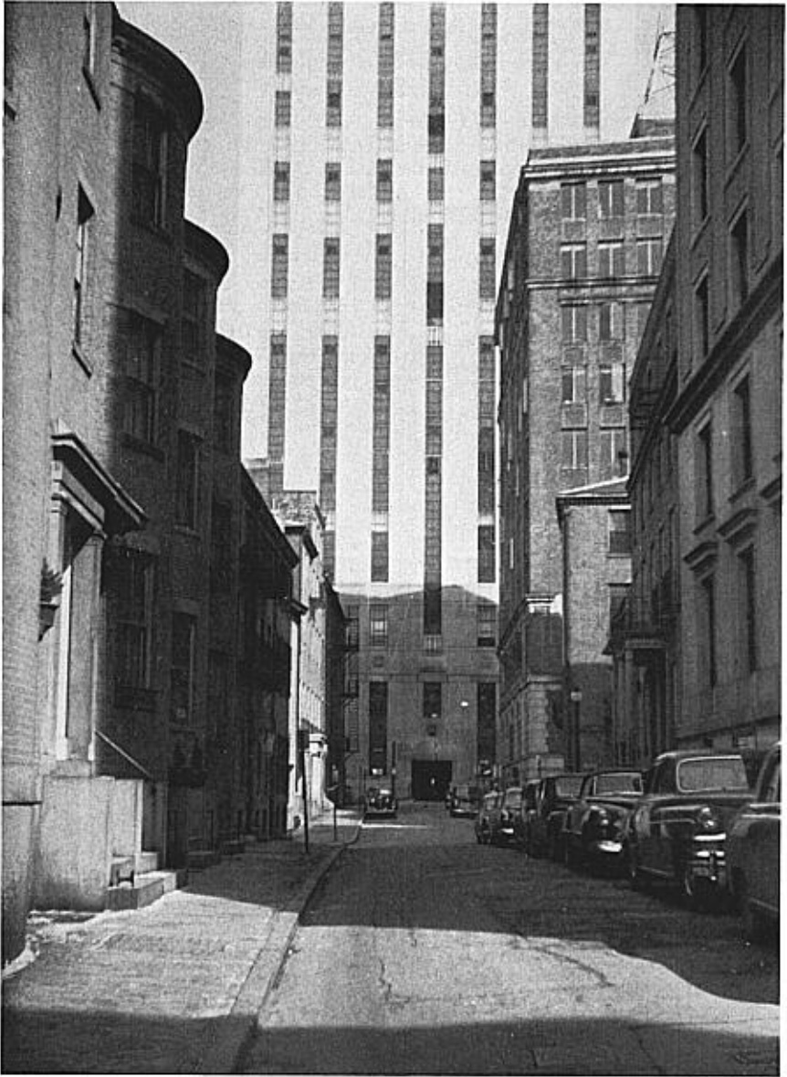
Allston Street, Beacon Hill, Boston, 1950