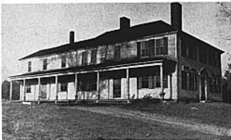
Tavern, Francestown, N.H.

from Cambridge Common to Fort Ticonderoga, and doubtless others, were still conspicuous as ancient and important highways by the frequency of old taverns along them. And many of these are still with us for a short, a very short, while longer, though few still offer the hospitality for which they were intended.