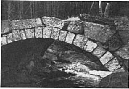
Double-arched Stone Bridge

tween cities and ignoring all differences in grade. 7 Causeways called "causeys" were built through swamps, and bridges both of wood and stone over streams. It is to this period that the covered bridges belong, and the beautiful old stone ones with the perfect arches. Much laborious