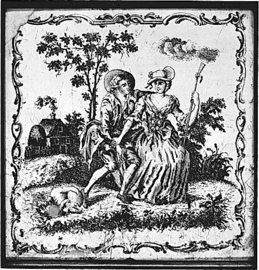
FIG. 3. ONE OF THREE SADLER FIREPLACE TILES, Circa 1765 , WHICH WERE SALVAGED FROM THE FOSTER-HUTCHINSON HOUSE IN 1833

part of the real estate whereof I shall die seized. . . ." 55 According to the terms of this provision, promptly carried into execution, 56 the once proud mansion, styled