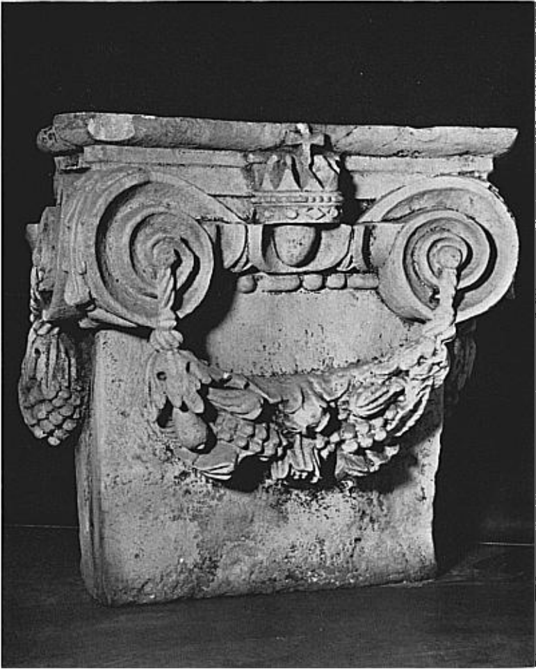
ONE OF FOUR PILASTER-CAPS OF PORTLAND STONE FROM THE FAÇADE OF THE FOSTER-HUTCHINSON HOUSE, BOSTON, 1689-1692